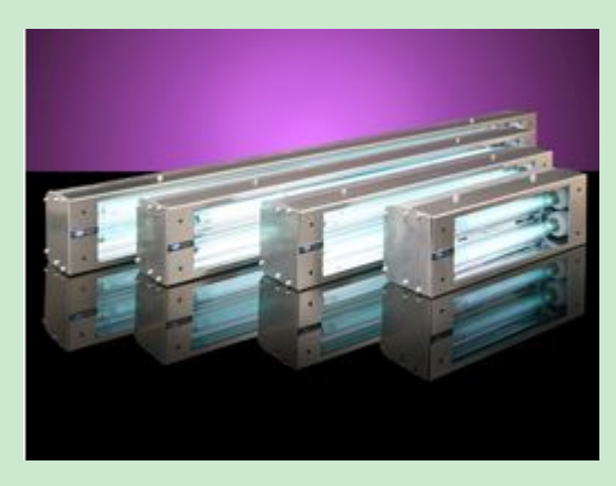
UV 150W High Output Germicidal Tube Unit