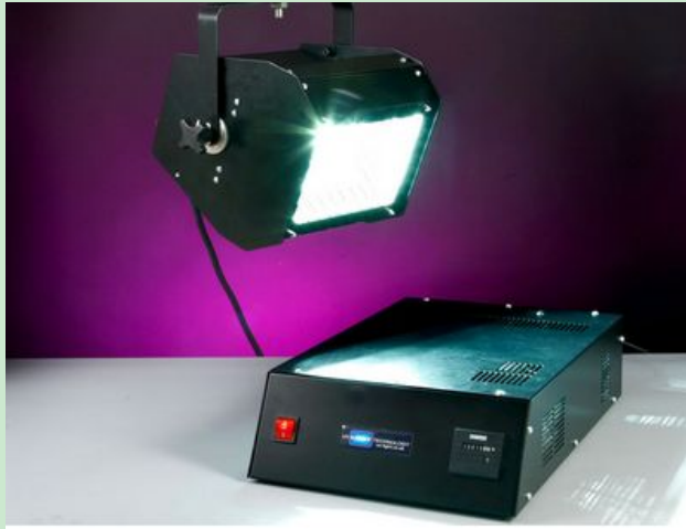
UV 800W Flood Lamp